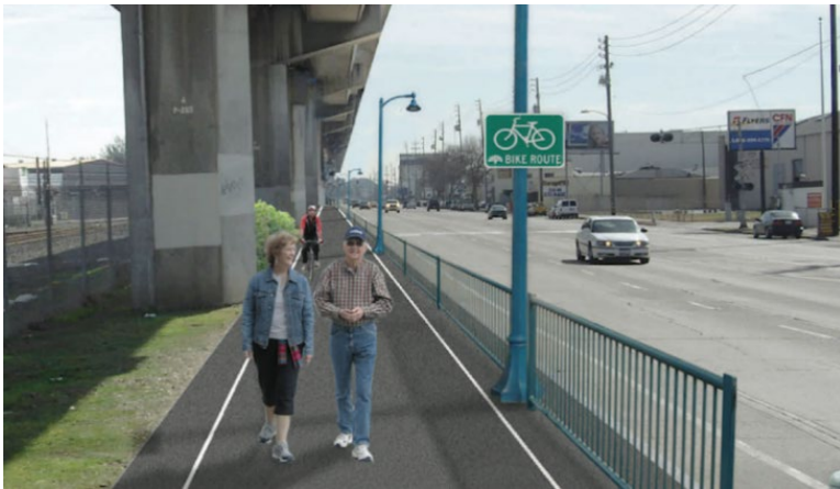
Rendering of East Bay Greenway.