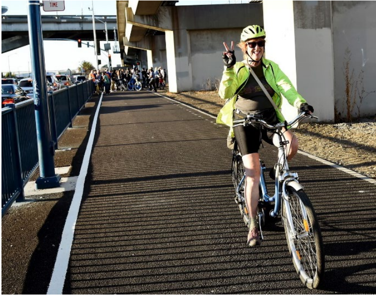
Initial East Bay Greenway segment from Coliseum BART to 85th Avenue (funded by Measure WW, TIGER and BAAQMD).