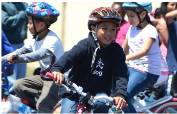
Thousand of Alameda County students participate in countywide events each year, including International Walk and Roll to School Day, the Golden Sneaker Contest, and Bike to School Day.