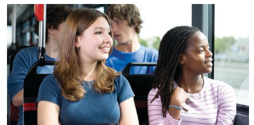
In addition to biking and walking, the SR2S Program encourages students to travel by transit.

For more information on upcoming SR2S events, visit www.alamedacountysr2s.org .