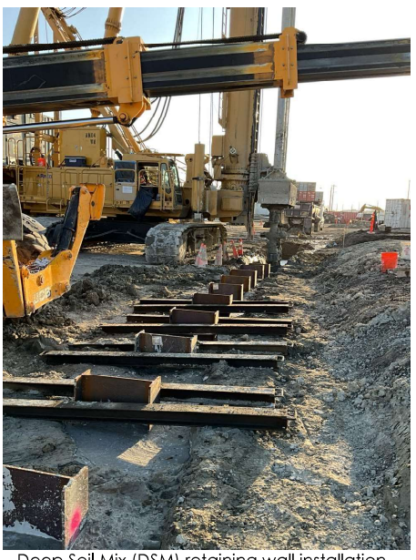
Deep Soil Mix (DSM) retaining wall installation.