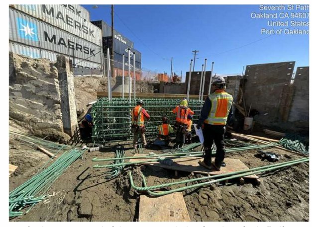
Kinder Morgan bridge support steel re-bar installation.