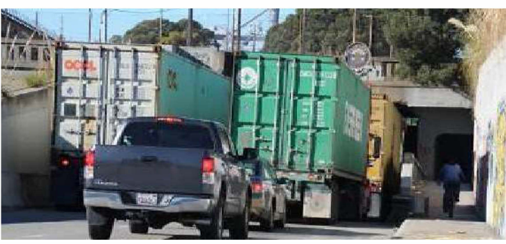
Existing 7th Street underpass with low clearance and lane width