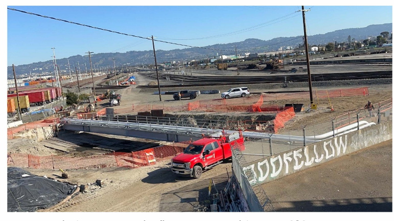
New Kinder Morgan Pipelines on New Bridge Jan 2025