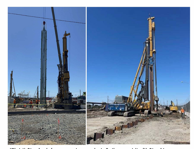
(Right) Steel reinforcement cage installation and (Left) Steel beam piles are driven into the ground in preparation for excavation of new roadway and bridge.